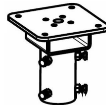
2-3/8" OD Tenon Mount Adaptor for Yoke Fixtures