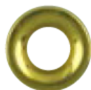
#2 Rolled Rimmed with Tooth Washer