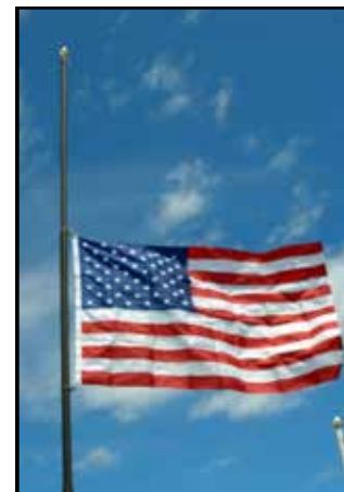
Fly your flag at Half-Staff using the 2 lower flag snaps