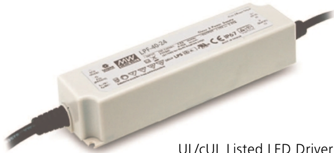
UL/cUL Listed LED Driver