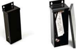
SG-AG-DRIVER Above Ground/Wall Mount Power Supply