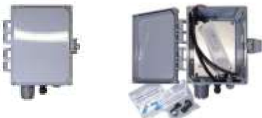
SG-MG-DRIVER Marine Grade Power Supply