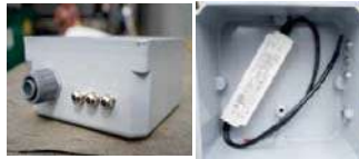
SG-IG-DRIVER In Ground/Direct Burial Power Supply