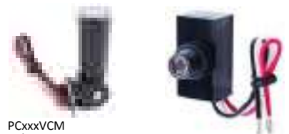
PHOTOCELL Dusk-to-Dawn Photocell for STARGAZER